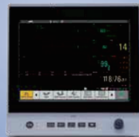
X-5 Patient Monitor